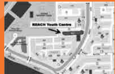
Maps taken from streetdirectory.com