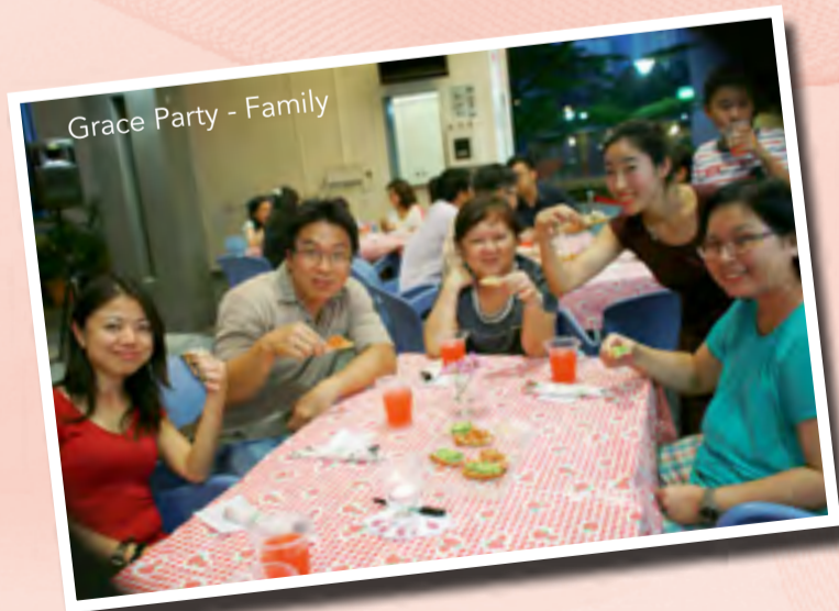
Grace Party - Family