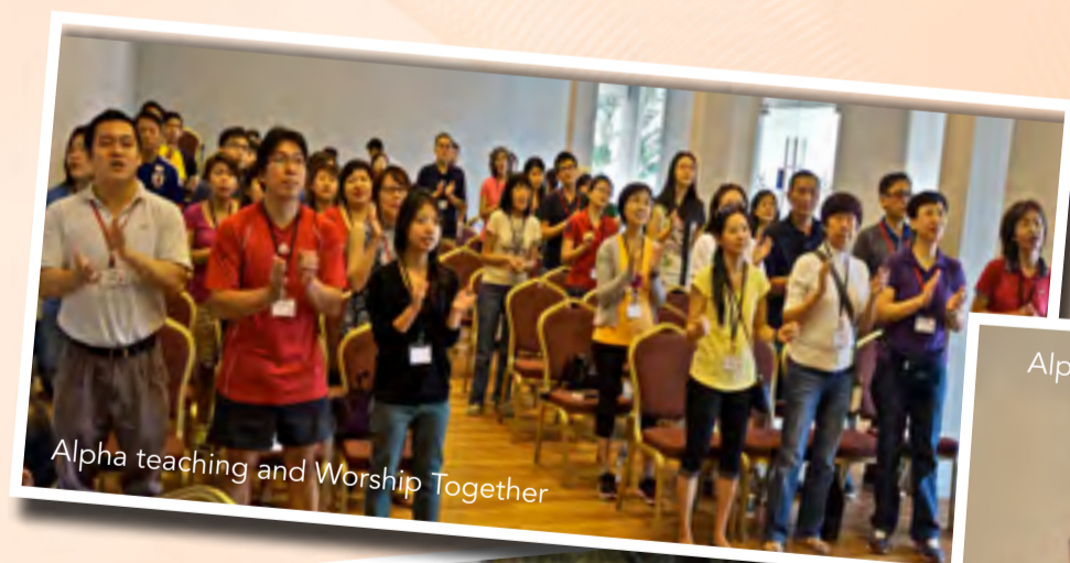
Alpha teaching and Worship Together