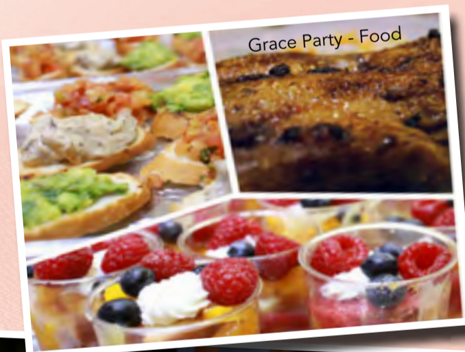
Grace Party - Food

The party is on 27 December, 7:00pm, GII Level 1 Fellowship Area. Please RSVP with Zixuan at zixuan.wang@graceaog.org / 64100835 by 22 December.