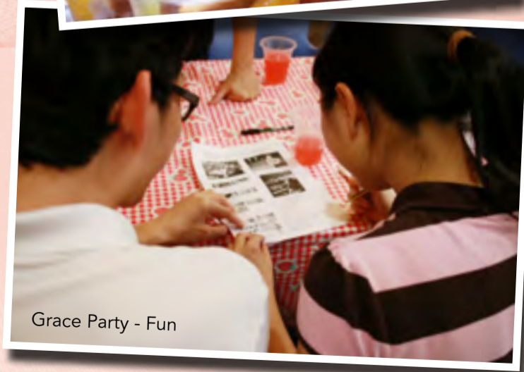
Grace Party - Fun