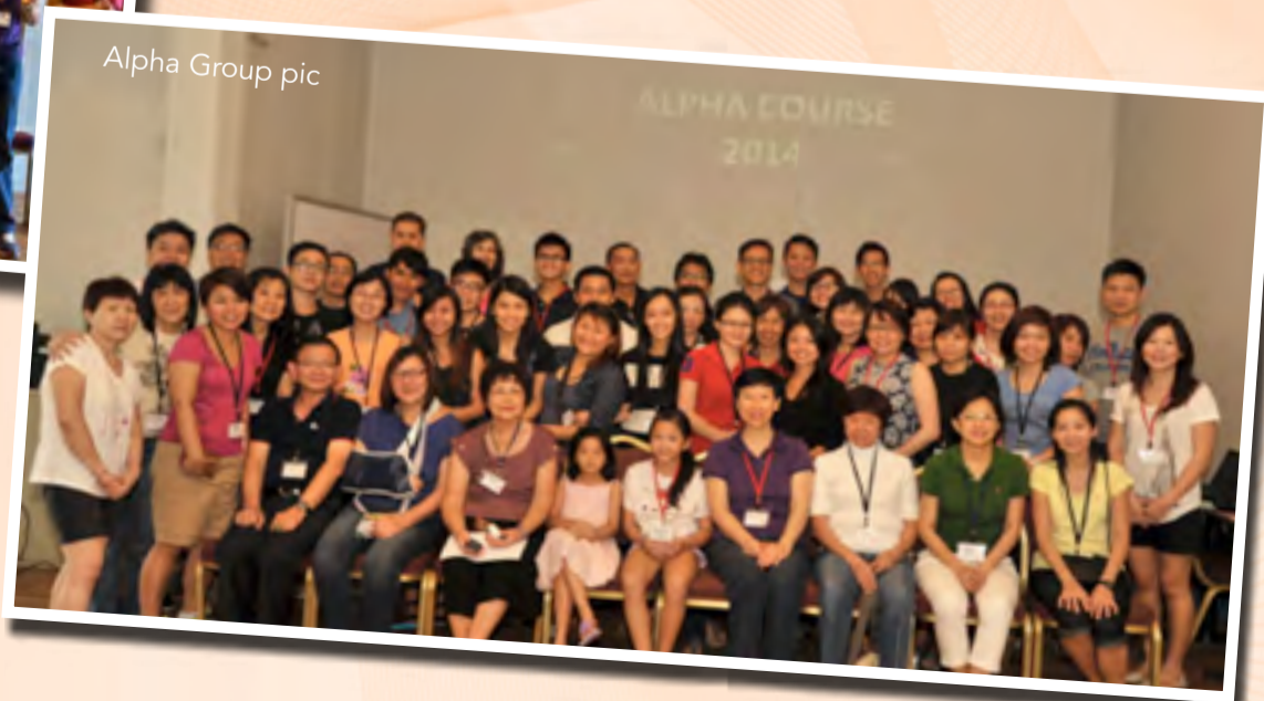
Alpha Group pic