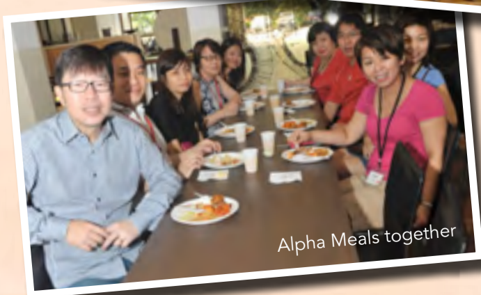
Alpha Meals together