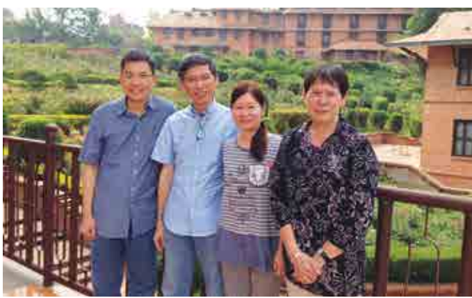
Leaders teaching in Nepal