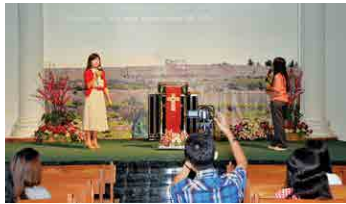
Leaders teaching in Madiun, East Java

I urge anyone who has a heart to minister cross-culturally to avail themselves in both of these countries. We hope to see more Grace members to take up the challenge to go forth into these mission fields to do the works of the Kingdom!