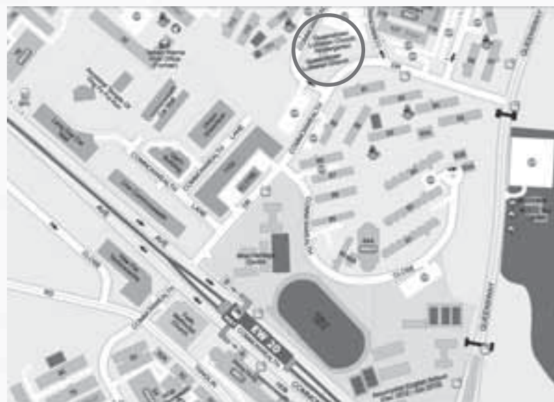
Queenstown Lutheran Church 709 Commonwealth Drive Singapore 149601 http://www.qlc.org.sg/about-us/service-times-and-location/