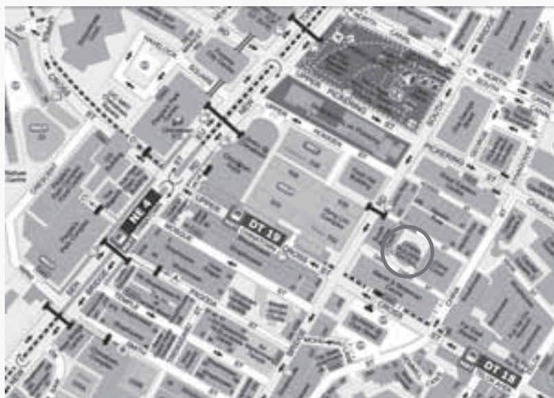
The 3rd Space 18 Cross Street #B1-05, China Square Central Singapore 048423 http://www.chinasquarecentral.com/getting-here