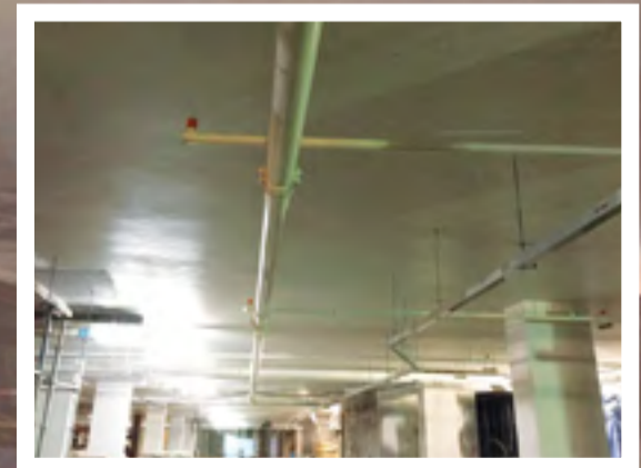
B3: Fire protection system