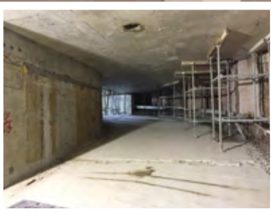
B1 to L1: ramp casting