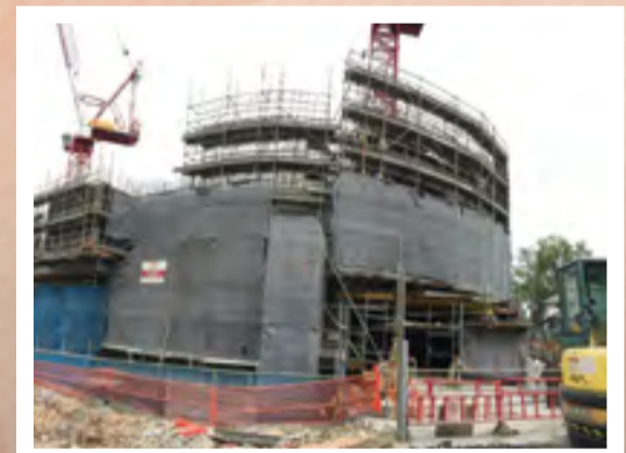
View from Tanglin Road