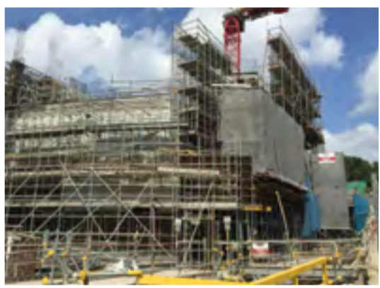
View from Jervois Lane