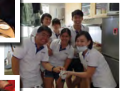
Innervate CrossFit raised funds exceeding $10,000 for REACH Youth to support and wider the youth outreach ▼