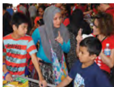
▲ Families "shopping" for foods sponsored by Joshua Research Consultants Pte Ltd at our annual Project Neighbour