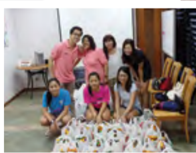
▲ Over 35 low income families benefitted from the monthly food distribution sponsored by Cargill Asia Pacific Holdings Pte Limited