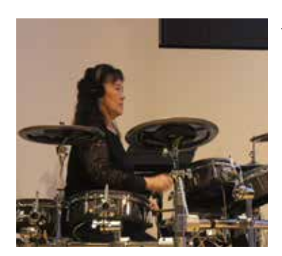
← Our time is in God's hand. There is always time to do God's work. - Phin Djin Djap