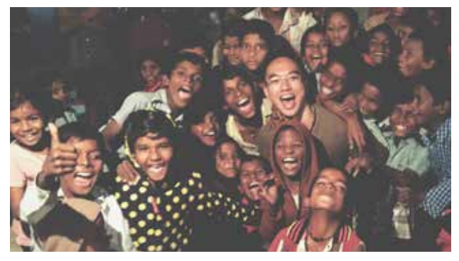
↑ Do not waste your time on things that have no kingdom value because our lives are as short-lived as vapours. – Chow Ming Yang