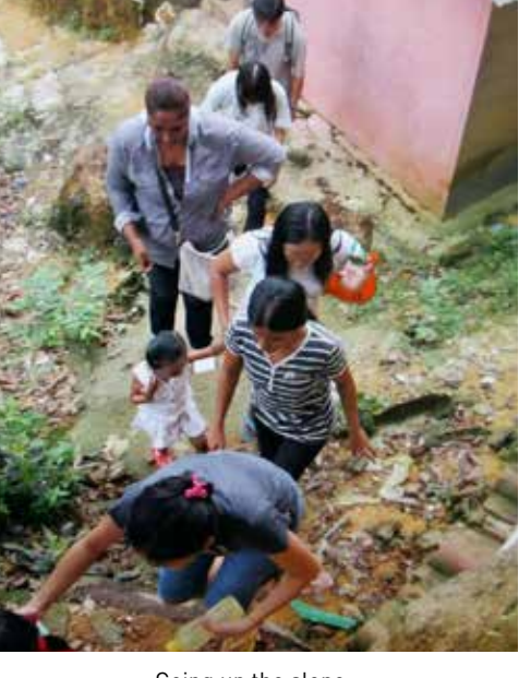
Going up the slope.

The feeding programme for the children was first started in the open space in front of a church member's house. Later, the Lord provided a community centre for us to carry out the feeding programme. We wanted to enlarge our territory by buying or building more community centres in the slums. However, all our plans failed. We also started a library, a tuition centre for the children and a project for mothers to make a living. All these did not turn out well. We did not understand why there were so many obstacles but we knew that as we presented these plans to God, He will direct us. All these challenges taught us to rest in God's perfect timing.