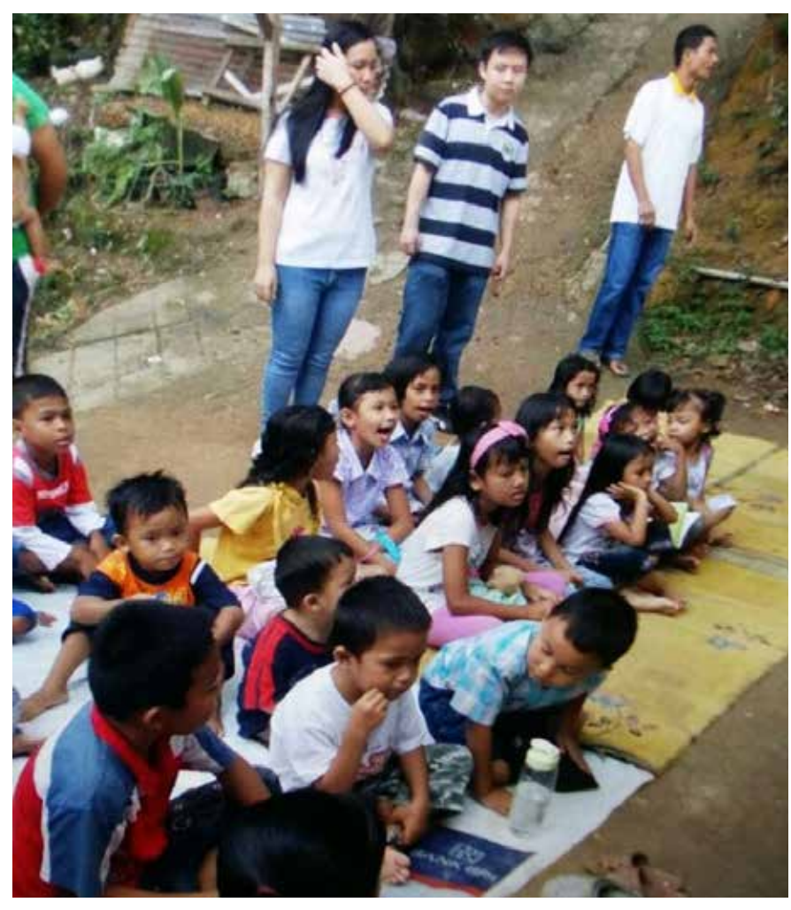
Children sitting on the mat and waiting.

JC: God always provides. He is our Jehovah Jireh. He provided the funds needed for the education and feeding programmes. In the earlier days, the feeding programme was conducted in the open. To prepare for it, the church staff would first need to clean the chicken droppings that were left behind from chickens running around the ground. Next, the staff would then roll out the straw mats on the