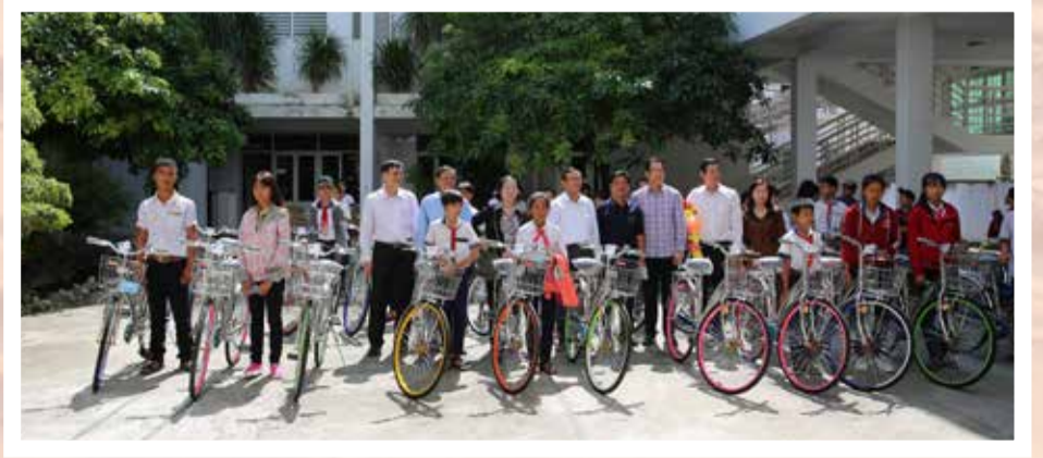
Ninh Thuan project