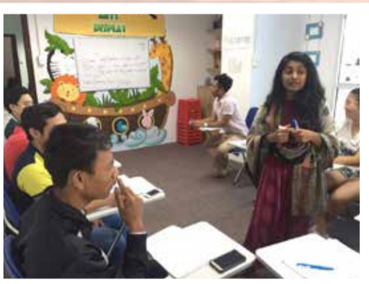
English classes in IGA