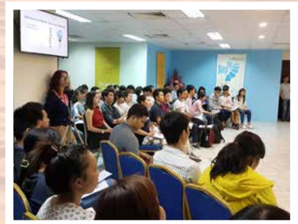
Lifeskills training in IGA