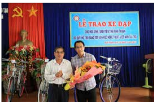
Ninh Thuan Director of Education

We sincerely thank our mother church Grace Assembly of God Singapore for making this mission work possible through their generous financial and spiritual support. Hallelujah! All praises, honour and glory to our Lord Jesus Christ!