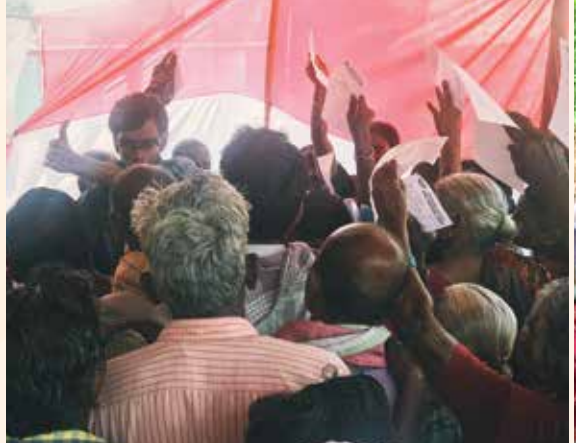
↑ Situation at the registration counter. Due to the tribal nature of the people, things can get quite messy.