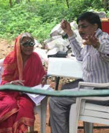
↑ Getting their eyes checked.