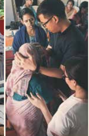
↑ Praying for the sick.

← This is how each of our medical camp looks like. It starts with the registration counter (extreme right), then the people are directed respective stations (children, eye, women, general, chiropractic). After they are done with the stations, the people will head to the pharmacy, and then exit the area by going to the church to be prayed for. Some of my team are doing children ministry and some of us are at the church 'prayer station'.