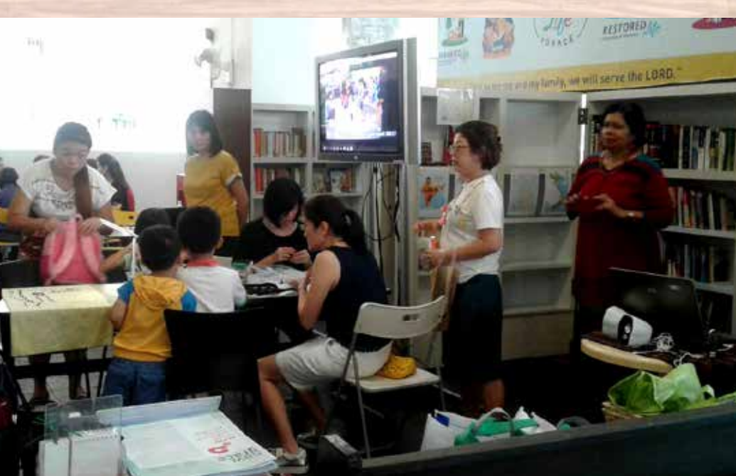
Missions Corner @ GII