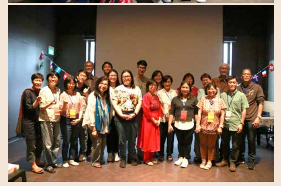
Top: The Kairos team. Centre/bottom: Participants attending the Kairos course.